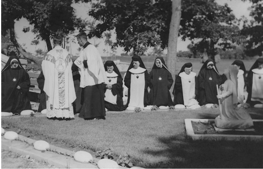
Marian devotions to the Oblate novitiate of St. Norbert in 1952.